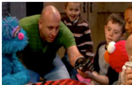
© 2009 Sesame Workshop. "Sesame Street" and its logo are trademarks of Sesame Workshop. All rights reserved. Photo by Richard Termine.