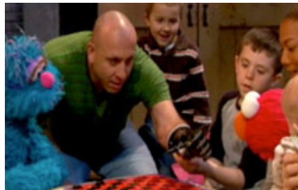
© 2009 Sesame Workshop. "Sesame Street" and its logo are trademarks of Sesame Workshop. All rights reserved. Photo by Richard Termine.